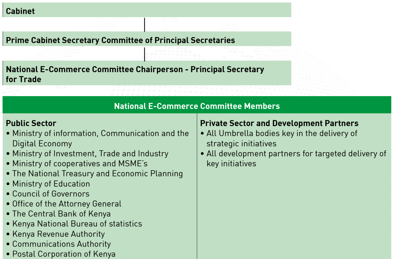
Table 4 Institutional Framework